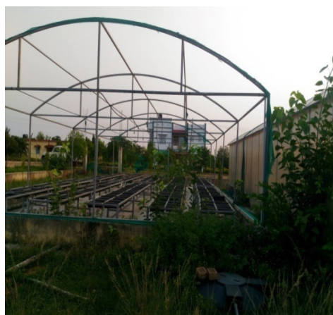
Hi tech nursery at Supha (Banka)

It was observed that six nurseries (except Motihari and Muzaffarpur which became operational in the year 2017-18 and produced only 67,123 and 5,531 plants respectively) out of the eight nurseries were not made operational for producing plants for the last four years despite incurring an expenditure of ₹ 164.98 143 lakh from CAMPA funds.